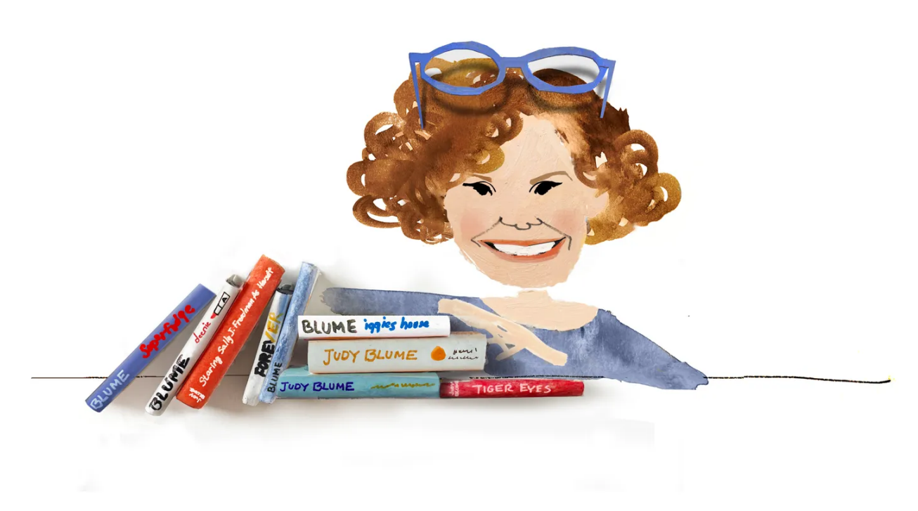
ILLUSTRATION BY RYAN MCAMIS